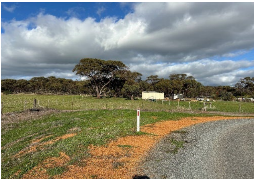
Photograph of the Forest St Reserve looking south from Lavender St towards Narrogin-Willaims Road. The Reserve is being grazed.