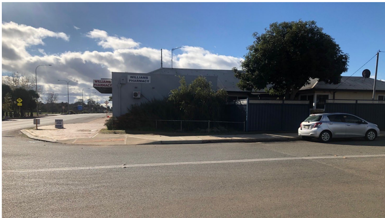
Photograph-New Street parking

Concept upgrades, sweep paths, and intersection modifications required to support RAV4 truck movements are shown on the following page. Main Roads WA have confirmed that these meet the required standards.